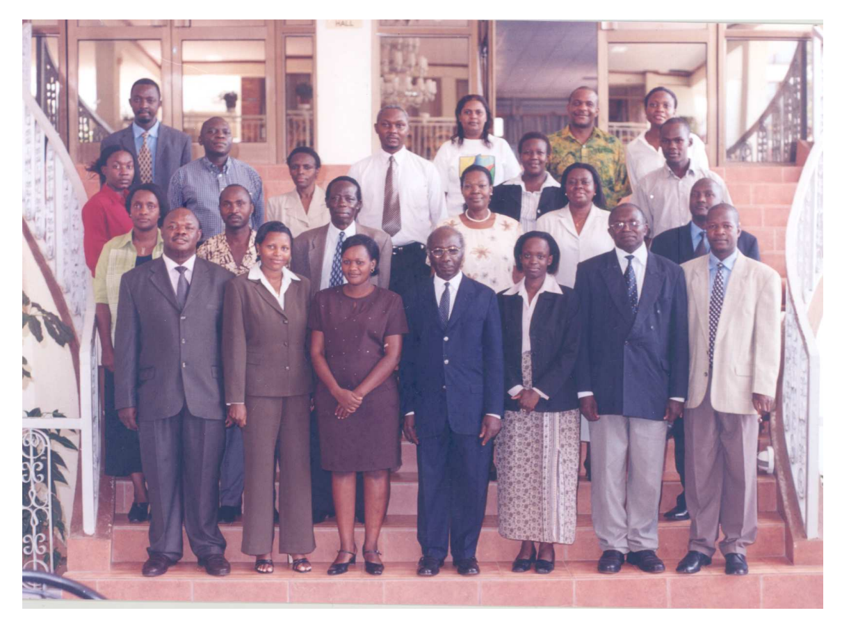
Members of staff of the Uganda Law Reform Commission attending a workshop.

The Amendment proposes to make provisions to apply to guardians as a category of persons to whom parental responsibility may be passed. It seeks to eliminate all traditional and cultural practices that are detrimental to a child's health, well-being, education or development. It also considers principles for determining harmful employment. Furthermore, specific amendment is being made relating to inter country adoption by reducing the thirty six months fostering period to twelve months and provides for interalia , exceptional circumstances under which a court may rescind an order of adoption.